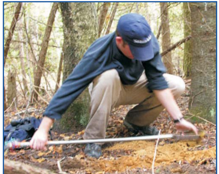
A terrestrial ecologist taking a soil sample.

Breeding birds and amphibians are used to determine the significance and sensitivity of wildlife occurring in a given area. Wildlife attributes for birds and amphibians are relatively easy to survey compared to other wildlife groups, their habitat requirements are well-understood and they provide reliable indicators of habitat quality, function and landscape connectivity.